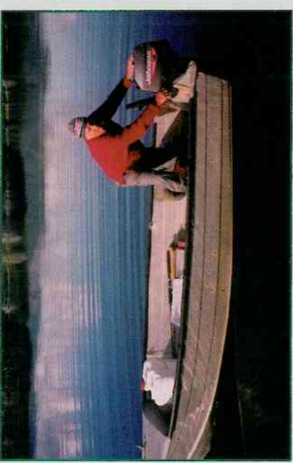
Lake Maratai. David Moate

Dam tail waters attract numbers of fish all year round and are a great place to catch trophy sized trout. Changing flows due to hydro power demands, provide a variety of fishing situations that are fun to experiment with and discover the best times to catch fish. WAIKATO DAM TAIL WATERS Dam tail waters attract numbers of fish all year round and are a great place to catch trophy sized trout. Changing flows due to hydro power demands, provide a variety of fishing situations that are fun to experiment with and discover the best times to catch fish. WAIKATO TRIBUTARIES Pueto Stream, Deep Creek, Whirinaki Stream, Tahunaatara Stream and the Mangakino River are excellent fisheries in their own right. The larger ones like the Pueto and Deep Creek offer kilometres of fishing. They receive large influxes of trout, during summer, seeking colder water, and again in winter, as adult trout move to their spawning areas. Numerous other small cold streams enter the main river and lakes providing fishing at their confluence or for a short distance upstream.