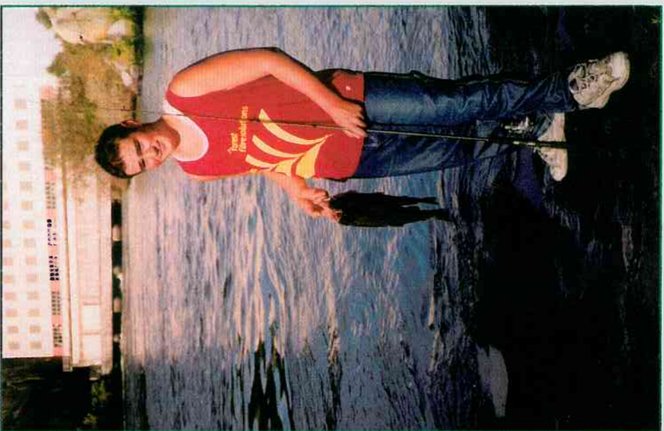
Whakamaru Dam Tail Water. David Moate

Dam tail waters attract numbers of fish all year round and are a great place to catch trophy sized trout. Changing flows due to hydro power demands, provide a variety of fishing situations that are fun to experiment with and discover the best times to catch fish. WAIKATO DAM TAIL WATERS Dam tail waters attract numbers of fish all year round and are a great place to catch trophy sized trout. Changing flows due to hydro power demands, provide a variety of fishing situations that are fun to experiment with and discover the best times to catch fish. WAIKATO TRIBUTARIES Pueto Stream, Deep Creek, Whirinaki Stream, Tahunaatara Stream and the Mangakino River are excellent fisheries in their own right. The larger ones like the Pueto and Deep Creek offer kilometres of fishing. They receive large influxes of trout, during summer, seeking colder water, and again in winter, as adult trout move to their spawning areas. Numerous other small cold streams enter the main river and lakes providing fishing at their confluence or for a short distance upstream.