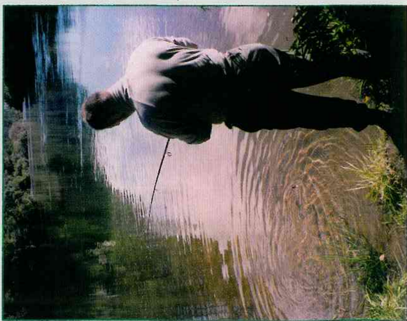
Waikato River above Lake Atiamuri.