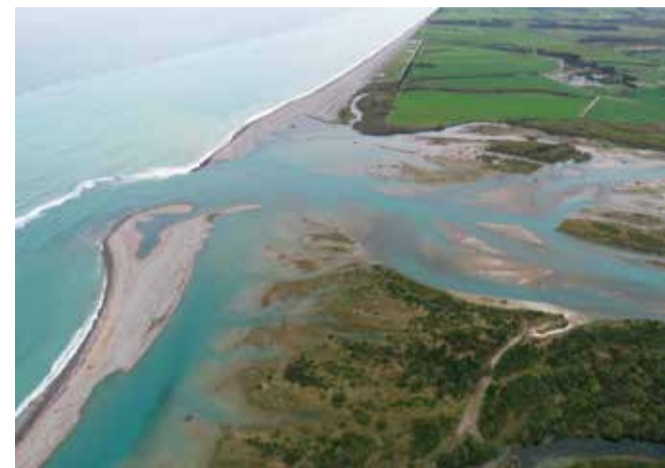
Aerial view of the rivermouth

The lagoon area and mouth are worth a cast for resident and sea-run brown trout that key into the prey fish species that live in the area.