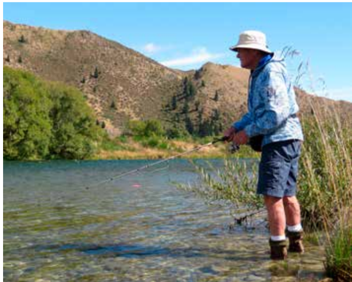
Spin fishing the stable waters at Kurow

The Waitaki River is famous for being the birthplace of salmon fishing in New Zealand. A hatchery located on a small creek of the Hakataramea River, a major tributary of the Waitaki, produced the first recorded salmon run in New Zealand in 1905. The salmon fishery is now a shadow of its former glory but still attracts a dedicated following of anglers each season.