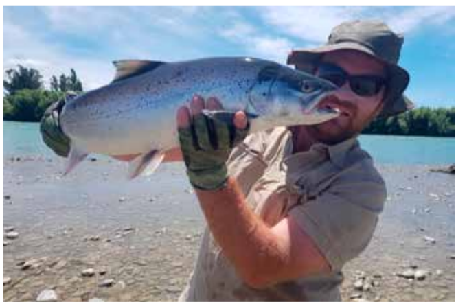
An exceptional Waitaki catch - a large sea-run brown trout

Both trout and salmon anglers who access the river by jet boat have a major advantage over the shoreline angler as they can access kilometres of braids and pools that are inaccessible by foot. The only fully formed boat ramp on the river is located between the bridges at Kurow and is popular with jet boat anglers, especially on opening day of the new season. Other popular spots for launching jet boats includes Duntroon, Bells Pond intake and the Te Maiharoa Rd access points.