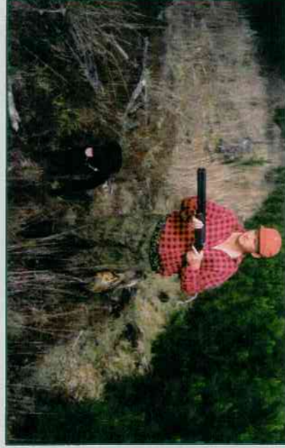
Pheasant Hunting

Game Bird Hunting is an exciting and challenging sport that is well catered for in the Eastern and Hawke's Bay Regions. This huge area provides a wide range of habitats that are home to 10 species of game birds. Whether you hunt open waters on lakes or estuaries, decoy and call ducks into farm ponds, stalk willow lined streams for waterfowl, enjoy trying to outwit pheasants or testing your shotgun skills on fast flying quail, hunting enthusiasts will find extensive opportunities in these areas. The game bird hunting season starts on the first weekend in May and normally runs through to the end of August with the occasional special hunting weekend during the summer.