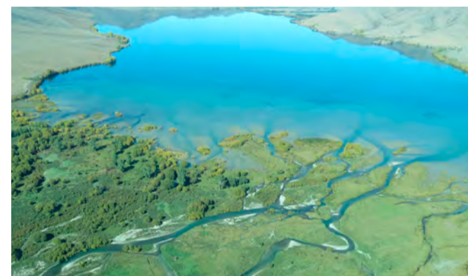
The delta of the Ahuriri River

2 Continue on SH 83 through Otematata climbing the Otematata Saddle where an elevated view of the Ahuriri Arm