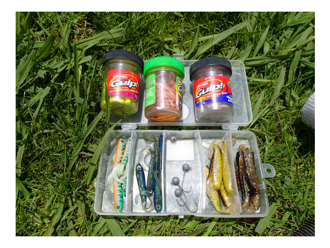
perch soft bait and baits.