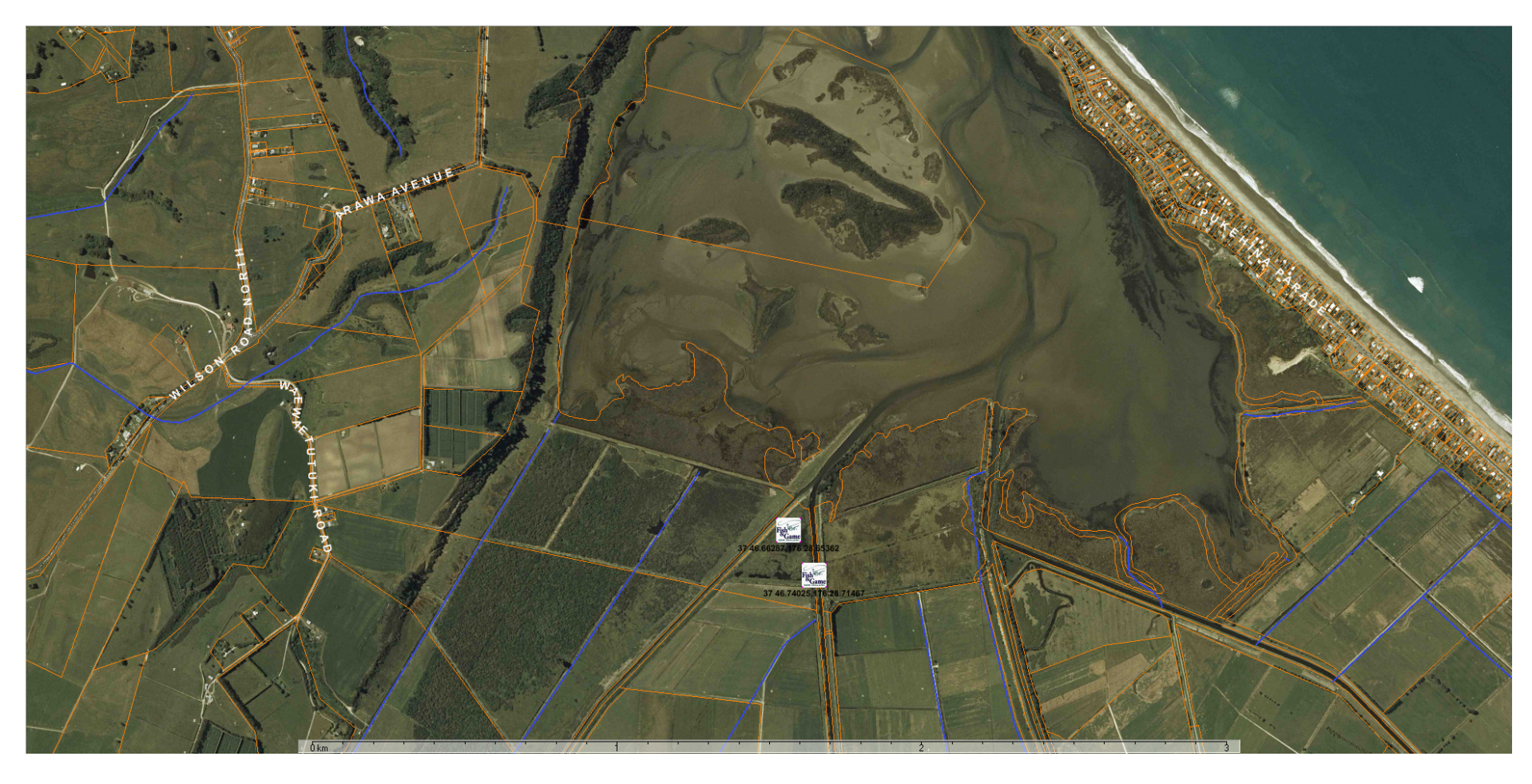
Figure 1. Waewaetutuki Reserve- access off end of Kaikokopu Road (see Figure 2 below). There are only two maimais (shown by Fish and Game icons on map); Stand 1 is the Northern most stand.