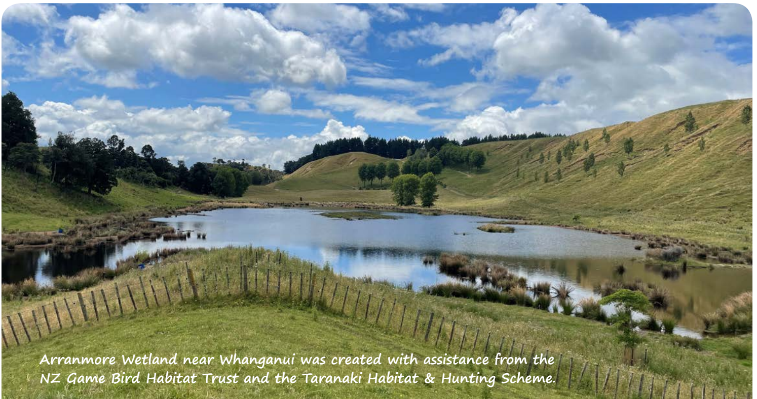
Arranmore Wetland near Whanganui was created with assistance from the NZ Game Bird Habitat Trust and the Taranaki Habitat & Hunting Scheme.