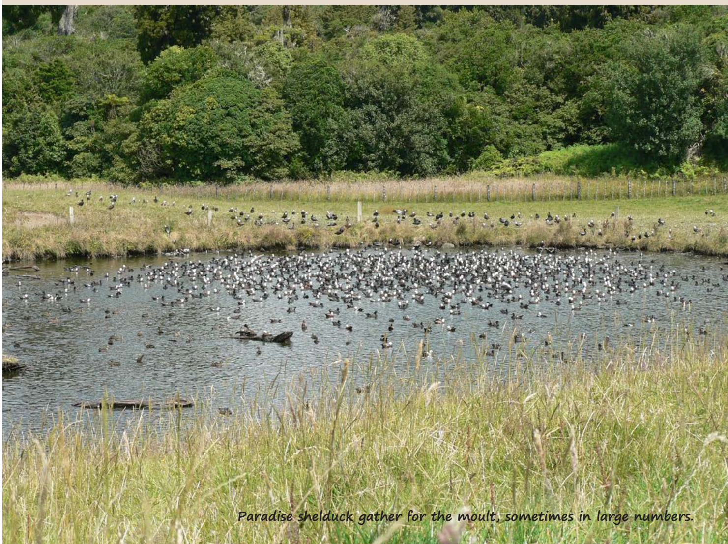
Paradise shelduck gather for the moult, sometimes in large numbers.

If you are a landowner and have congregations of moulting paradise shelduck on your lakes, ponds or rivers from late December each year give us a call and we can incorporate the site into our monitoring programme. If paradise are causing damage to your pasture or crops at any time of the year, then also give us a call.