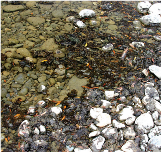
Blue-green algal mats at the water's edge