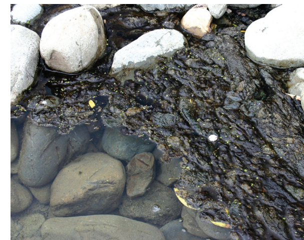
Blue-green algal mats forming a floating 'raft' on the water's surface

If you see thick blue-green algal mats, please contact Greater Wellington on 04 384 5708 or your local council.