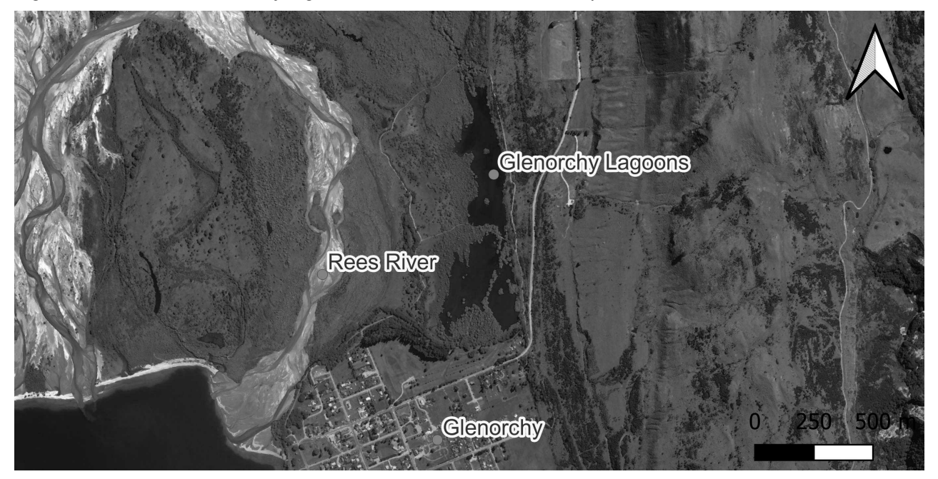
Figure 1: Location of Glenorchy lagoons at the head of Lake Wakatipu

The fishery currently has a season of October 1 to April 30 and a bag limit of one trout. Submitters have requested that the fishery is open to fishing year-round to help move angling away from more pressured waterways nearby.