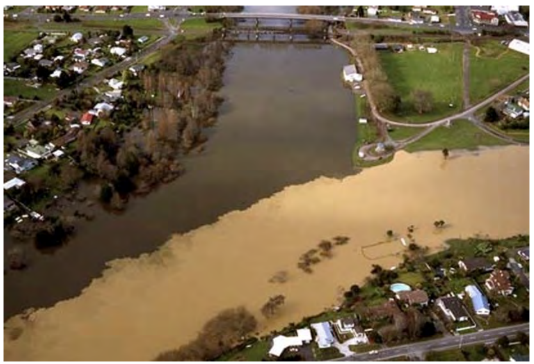
Figure 1 . Waipā River showing an extensive sediment load compared to the Waikato River (left) at their confluence at Ngāruawāhia.

Waikato Regional Council (WRC) notified the proposed Waikato Regional Plan Change 1 "Healthy Rivers/Wai Ora" – Waikato and Waipā Catchments (PC 1) in October 2016. PC1 sought to give effect, in part, to obligations to restore and protect the Waikato and Waipā Rivers by reducing the presence of four key contaminants: nitrogen, phosphorus, sediment and microbacterial pathogens. The Waikato and Waipā Rivers and their associated lakes and wetlands have been severely impacted by intensive farming (Figure 1). PC1 sought to do this by imposing additional controls on land use in the Waikato and Waipā River Catchments, including on farming activities. It was promulgated to address significant freshwater quality issues in accordance with the National Policy Statement – Freshwater Management and was intended (and required) to give effect to Te Ture Whaimana o Te Awa Waikato Vision and Strategy for the Waikato River, which is part of the Regional Policy Statement. This is required by the Act and the legislation enacted to settle raupatu claims of the River Iwi. Given the importance of these rivers to the cultural, social and economic health and wellbeing of the community the Council serves, it was inevitable that there would be significant interest in PC1, in fact 1,063 submissions were made.