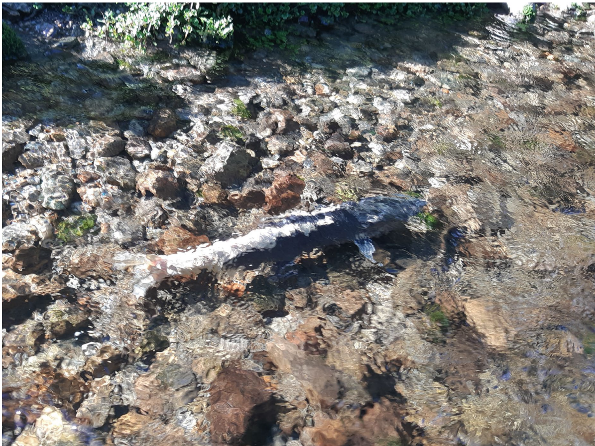
A salmon spawning in The Windbag, Lake Paringa, May 2022.