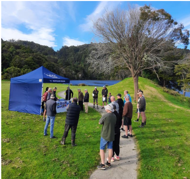
NFGC staff addressing attendees at the Whau Valley Fishing event on 5 th October 2024