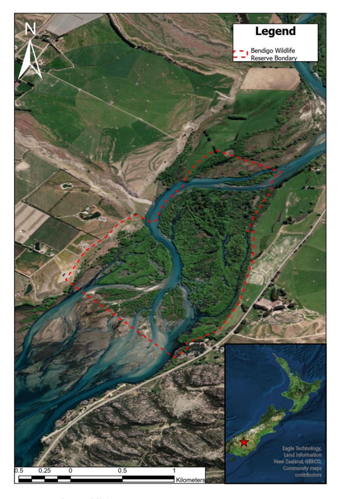
Map 1. Bendigo Wildlife Management Reserve