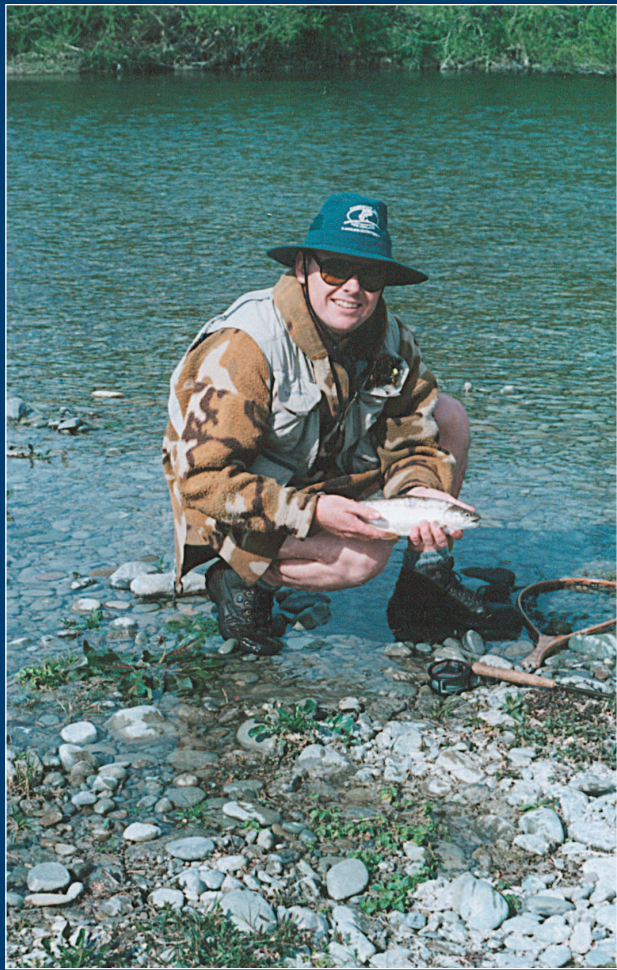
A successful angler on the Opihi River