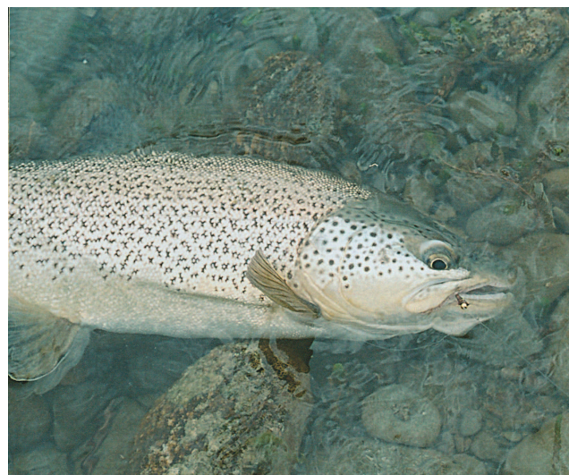
A Brown Trout is deceived by a bead head H/C nymph.

As a result of warm nor-west rain and snow melt the larger Rakaia and Rangitata Rivers often flood and during these times the spring fed Opihi River becomes a popular alternative as anglers seek clear flows and migrating salmon.