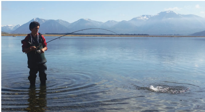
'Salmon on' at Lake Heron.

Fishing from rowboats or flotation tubes can open up more water to the angler, however be wary of the strong North West wind that can make these lakes dangerous for boats. It is important to note that all lakes (within the Ashburton Basin), with the exception of Lake Camp, are reserved for non-powered vessels. More information on general boating restrictions can be found in the Environment Canterbury boating guide ( www.ecan.govt.nz ). Please note that some fishing restrictions apply to the use of boats and angling methods so make sure you check your current sport fishing regulations guide supplied with your licence.