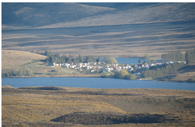
Lake Clearwater huts nestled between Lake Clearwater and Lake Camp.

From Hakatere Corner continue straight on the gravel road for around 9km. Lake Camp is on the left side of the road and can be accessed by a number of tracks that go to the lake edge or walk from the road. The Lake Clearwater hut settlement and camping ground can be found at the western end of the lake.