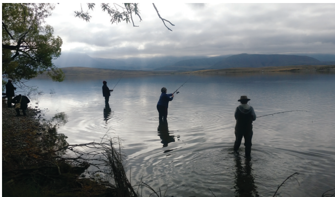
Anglers form a 'picket fence' at the Sheep Yards, Lake Heron.