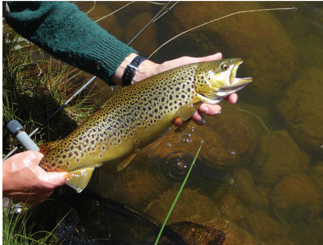
A well conditioned Ashburton Lakes brown trout.