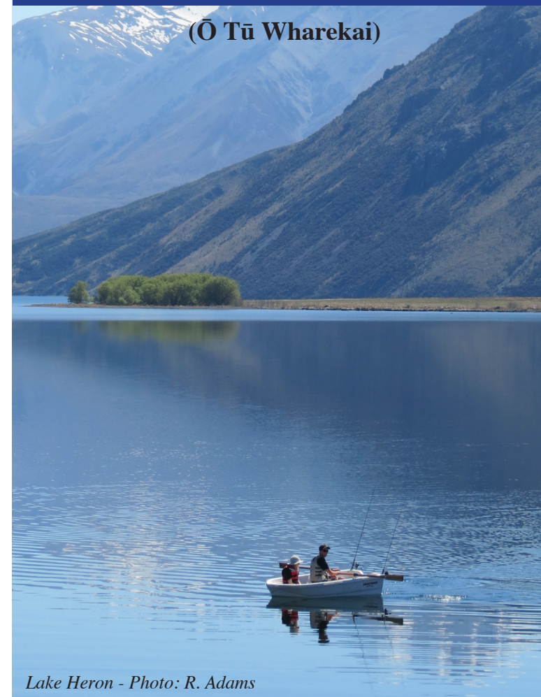
Lake Heron